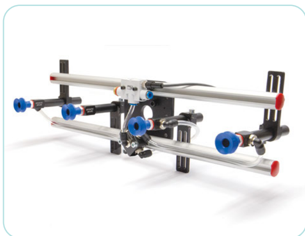
Easily modify configurations when your application changes.