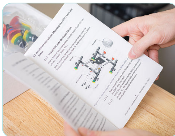
Our User Guide provides all information from setup to troubleshooting.