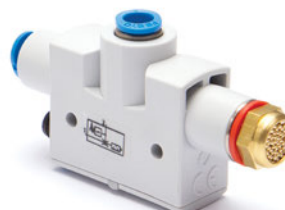
#8091 with silencer #8069

Two cable management clamps with non-slip Velcro strap.